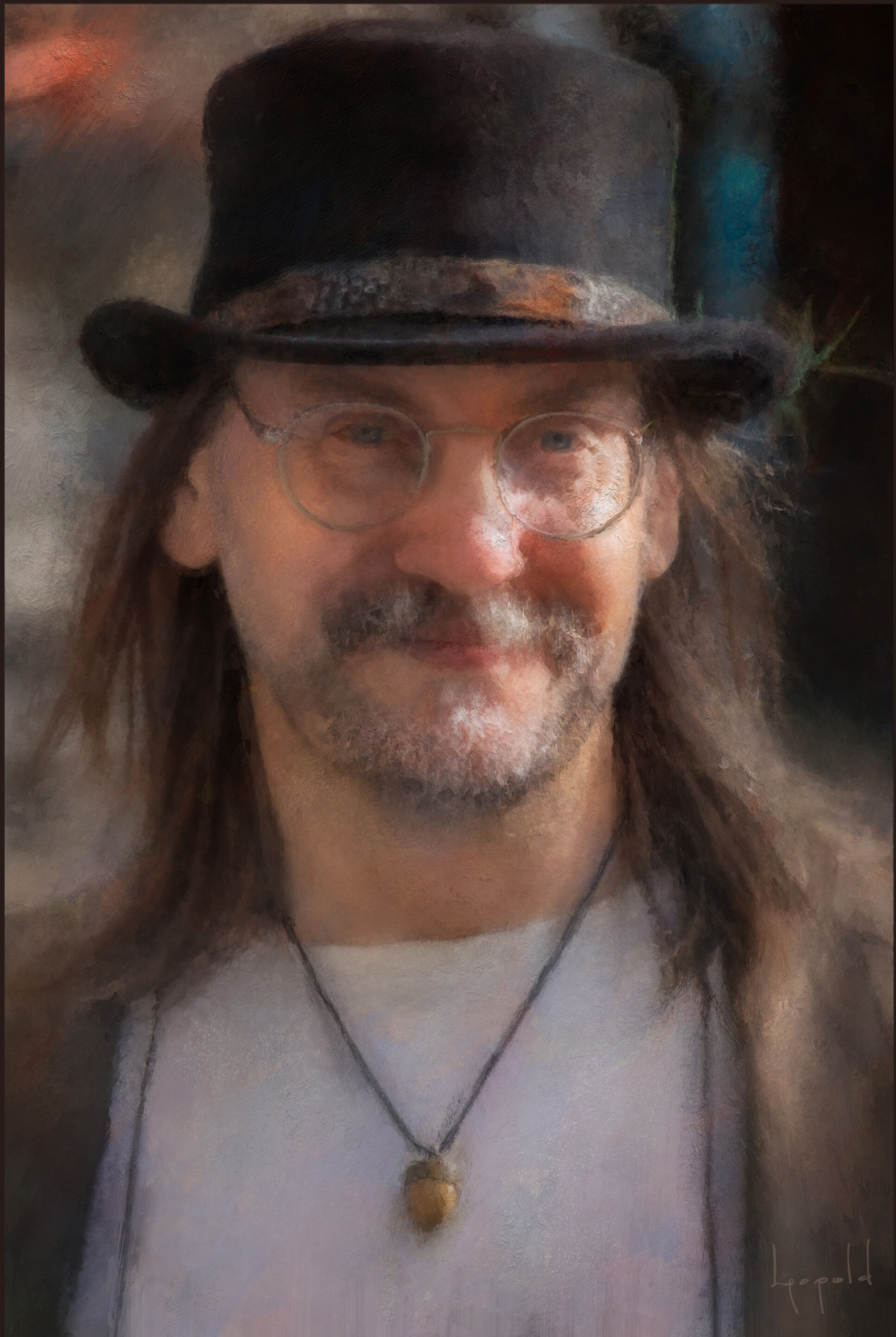
Ola by Leopold. Alphoszo.