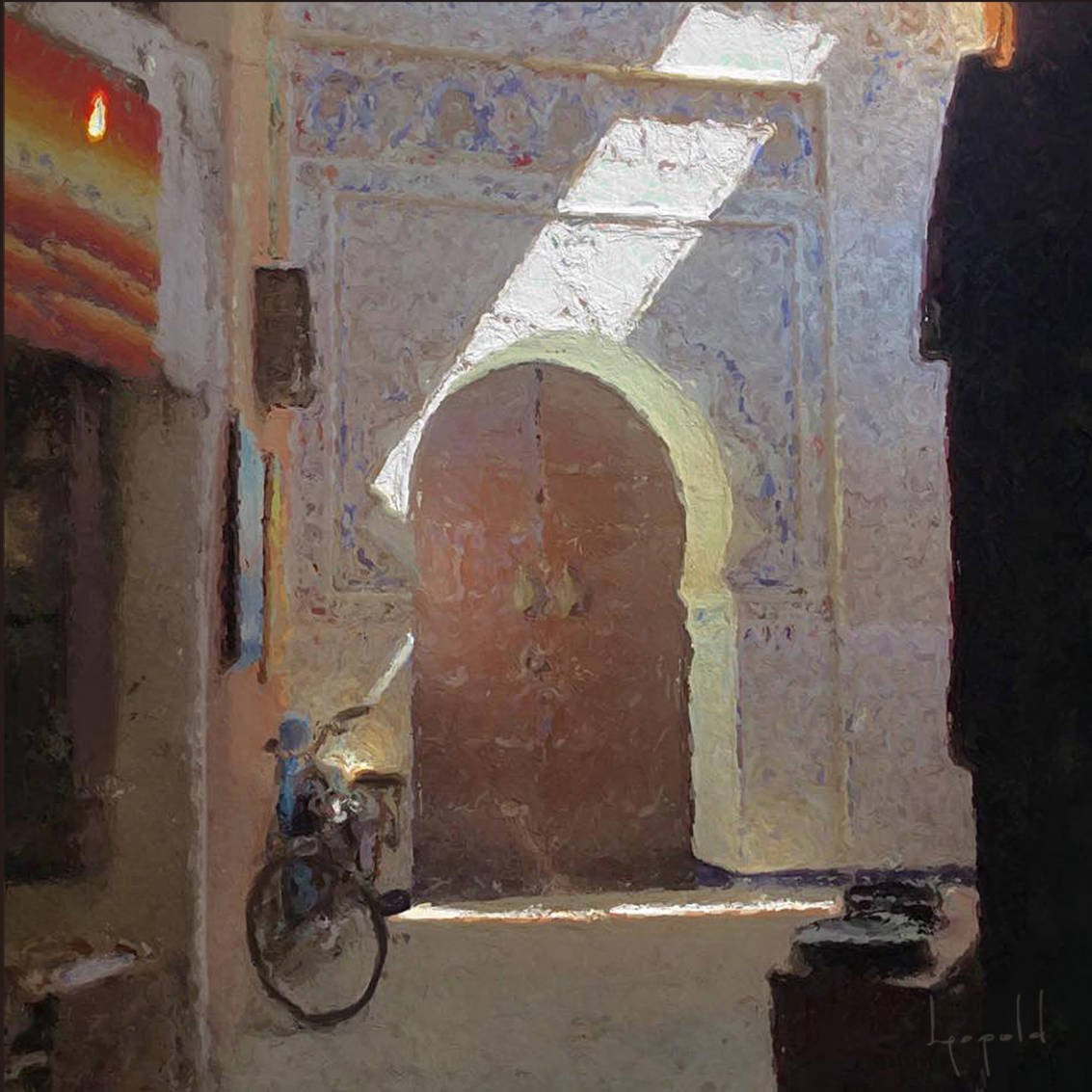
Mirror of Destiny by Leopold. Plein air Alphoszo.